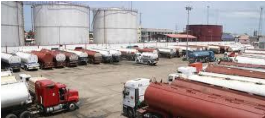
Figure 1 Petrol Tankers

https://www.google.com/search?tbs=simg:caqsngijx-uoic1skwsakgilelcmpwggaygpgcamskkoykrwygkanta27dakylbiwgk4nht-zp_1siyznsk4i_19tmdp7a5ztkame479wssozl0ykupp8mtfcb77kmv1k1f75zi4i3lwaiqs4x-zjtsdz9_14txnb2ovyaedasqj7-cbokcggiariewowygwlej3twqkaigekfgoecm9hznqlipydcgoil20vmdznmokggohcgfya2luz9qlipydcwojl20vmdfqcdc2chckbhnpbg_1apyj2awskcs9tlza5mtfdaoucgnjyxlapyj2awkkby9tlzbrngokjqosy29tbwvvy2lhbc2zwhpy2xl2qwi9gmlcgkvbs8wzmt3amcm&q=aym+shafa+depot+warri&tbm=isch&sa=x&ved=2ahukewj24ench47oahvccxokhdfwdvuq2a4oaxoecaiqjg&biw=1366&bih=608